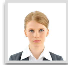
Examples of acceptable photos